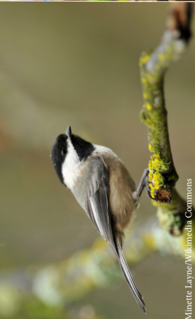
Mineette Layne/Wikimedia Commons