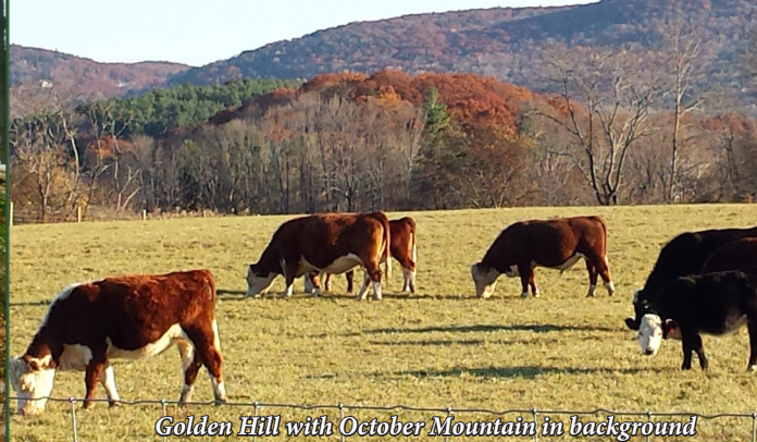
Golden Hill with October Mountain in background