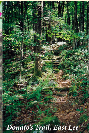
Donato's Trail, East Lee