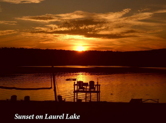
Sunset on Laurel Lake